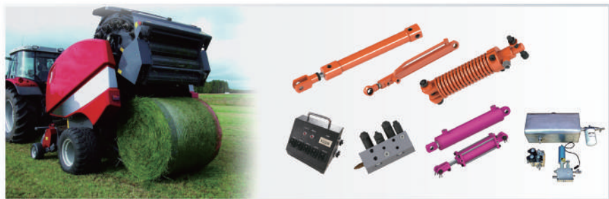
High-Level Agricultural Machinery