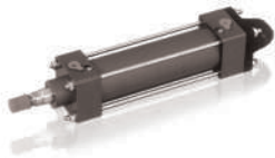
In 1973, the first Chinese pneumatic cylinder was born in Yantai FAST